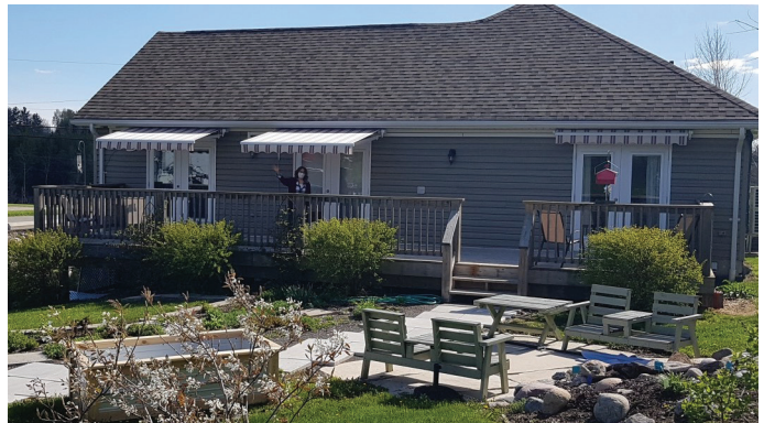
Awnings amid a pandemic? Why yes! As we have to restrict the number of visitors allowed indoors, "non-essential" guests can visit from the safe distance of our resident wing deck. Besides protection, the awnings will maximize comfort for our residents who want to feel the breeze on their skin and enjoy the sights and sounds of the garden. (Via a grant administered by Campbellford/Seymour Community Foundation.)