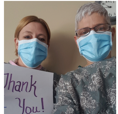
Early into the pandemic, clinical PPE (masks, shields, gowns and gloves) was in short supply for our nurses and PSWs. We were so grateful when community sewers donated handmade gowns and masks, which could be used by visiting family members.

I am proud to report The Bridge Hospice now offers bedside nursing 24/7, complemented by outstanding PSWs who provide the highest quality of personalized care. And when our volunteers return, wow – what a phenomenal team!