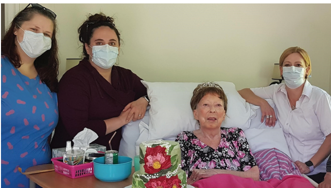
Birthdays are to be celebrated, especially when it's the last hurrah – so important for our residents and for their families who have a happy memory to hold onto.