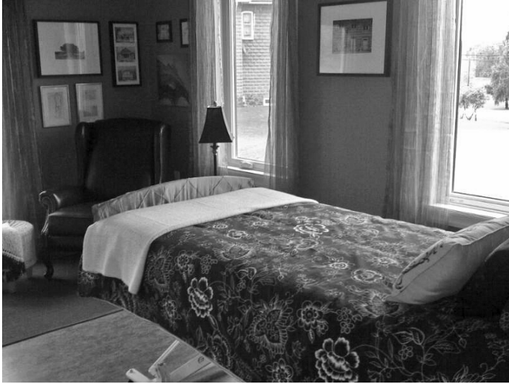
Each of our three resident rooms is private and comfortable, with natural light and walkout to a deck.

Making decisions for end-of-life care – whether for a family member or oneself – is usually uncharted territory and emotionally fraught. There is no one-size-fits-all, and needs can shift quickly. Knowing your options is empowering.